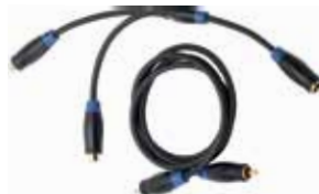
Included Cables: [1] RCA "Y" splitter cable [1] 1 meter RCA male to male cable