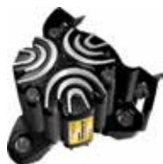
[1]ButtKicker® mini Concert or 2 ButtKicker mini LFE