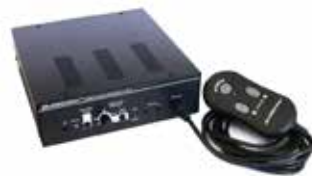
[1] BKA-130-C Power Amplifier and Remote Control