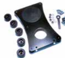
[1] or [2] ButtKicker Couch/Chair Mounting Accessory Kits (BK-CMAK)